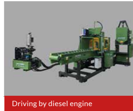
Driving by diesel engine