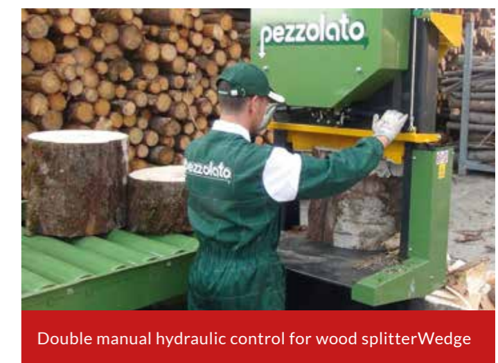
Double manual hydraulic control for wood splitter