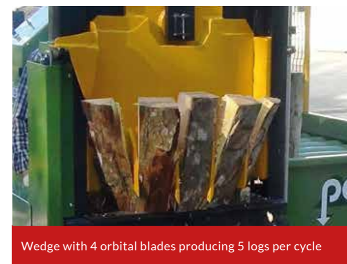
Wedge with 4 orbital blades producing 5 logs per cycle

Thanks to its large stock, Pezzolato is able to send and deliver any spare parts at customers' premises all over the world, within 24/48 hours.