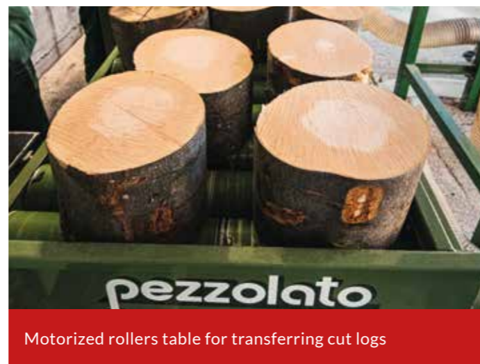
Motorized rollers table for transferring cut logs