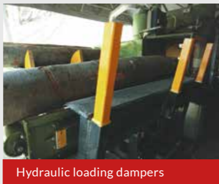
Hydraulic loading dampers