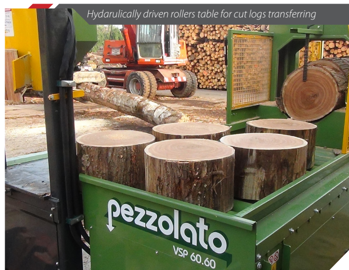
Hydraulically driven rollers table for cut logs transferring