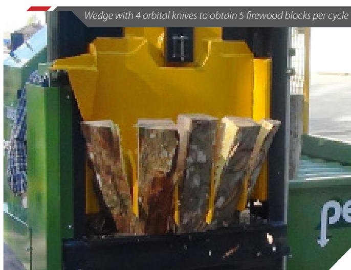
Wedge with 4 orbital knives to obtain 5 firewood blocks per cycle

Thanks to its large stock, Pezzolato is able to send and deliver any spare parts at customers' premises all over the world, within 24/48 hours.