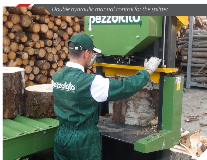
Double hydraulic manual control for the splitter